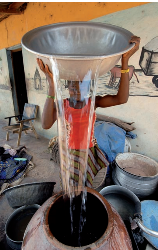
Global phenomena: Poor quality of drinking water in poor countries

trade impacts on water quantity and quality, climate change). Many local phenomena occur globally such as erosion, eutrophication, urbanisation, biodiversity loss, or the introduction of invasive species. The same is valid for many human health issues like the poor quality of drinking water supply and of sanitation in poor countries. Such local phenomena may imply alarming global trends. Given these developments one may ask if current fora and processes of global water governance provide the necessary institutional framework to meet present and future challenges. In their analysis of the current state of global water governance Pahl-Wostl et al. (Pahl-Wostl, C. et al. 2008) noted the diffuse and fragmented character of today's Global Water Governance with heterogeneous players without indications of emerging global leadership. The lack of strong motivation within UN agencies and states to push water management has been compensated by the rise of pluralistic bodies trying to deal with these issues. UN Water, the