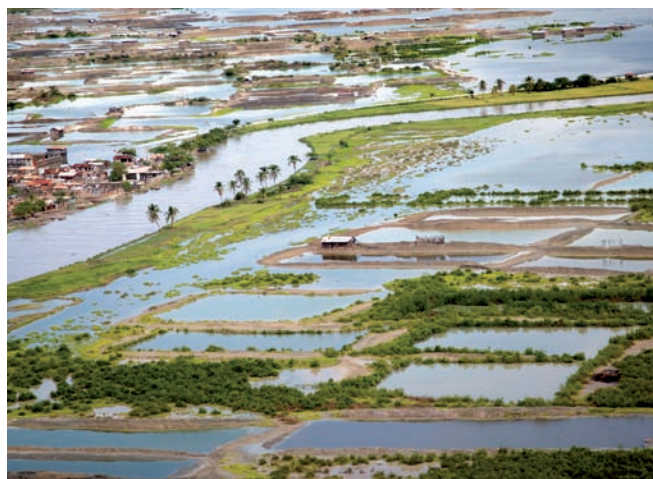
Understanding the connection between changes in a river basin and driving forces originating outside of the basin

In particular, this conference focused on understanding the connection between changes in a river basin and driving forces originating outside of the basin, e.g. the impact of climate change on river basin water availability, or the influence of international food trade on land use and resulting hydrologic changes within a basin, or the impact of international financial institutions on the development of water infrastructure within particular river basins.