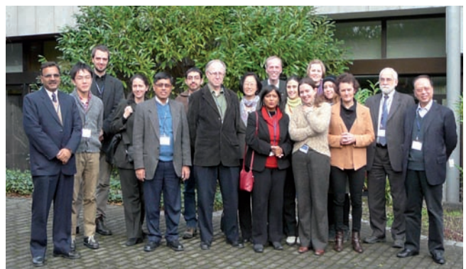
Participants of the SSC Meeting 2010 in Bonn, Germany