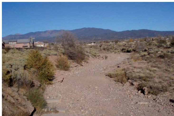
Dry Santa Fe River in New Mexico

If good governance is not the path to a healthy river, what is? The answer, in my view, is “ethics”. A new ethic about living in harmony with Nature can be the motivation for restoring the river. Sustainable urban development in Santa Fe needs to give priority to the river and build around and with the natural environment.