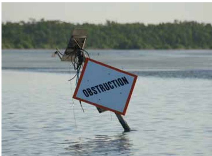
Uncoordinated local human actions lead to global changes and affect the global water system

We believe that such synergies between such events will facilitate to shape Future Water Agenda, which is relevant for both policy and practice.