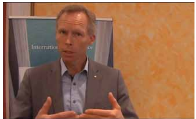
Johan Rockström during the interview

understand that the biosphere, the environment at large from freshwater to biodiversity, is actually the basis for our economy, and that good business good development, good welfare originates from a very wise stewardship of the biosphere. The third reason is that we are living in an era where everyone understands that we are in the globalized phase of the economy, the globalized phase of communication and increased understanding has developed that we are in the